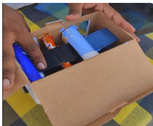
3 rd Prize Radiographic film Recycler