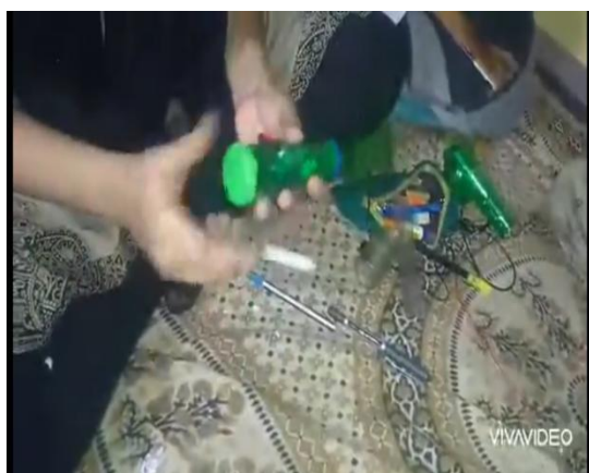
2 nd Prize Hand Made Torch